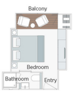
Panorama Suite (C) 180 Sq'