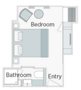
Emerald Stateroom (D) 162 Sq'