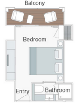
Grand Balcony Suite (S) 210 Sq'