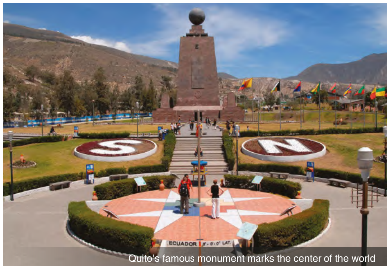
Quito's famous monument marks the center of the world

DAY 1 Depart the USA: Depart the USA on a flight to Quito, Ecuador. Enjoy a free evening to experience this amazing city on your own.