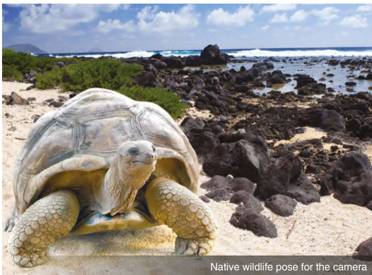
Native wildlife pose for the camera